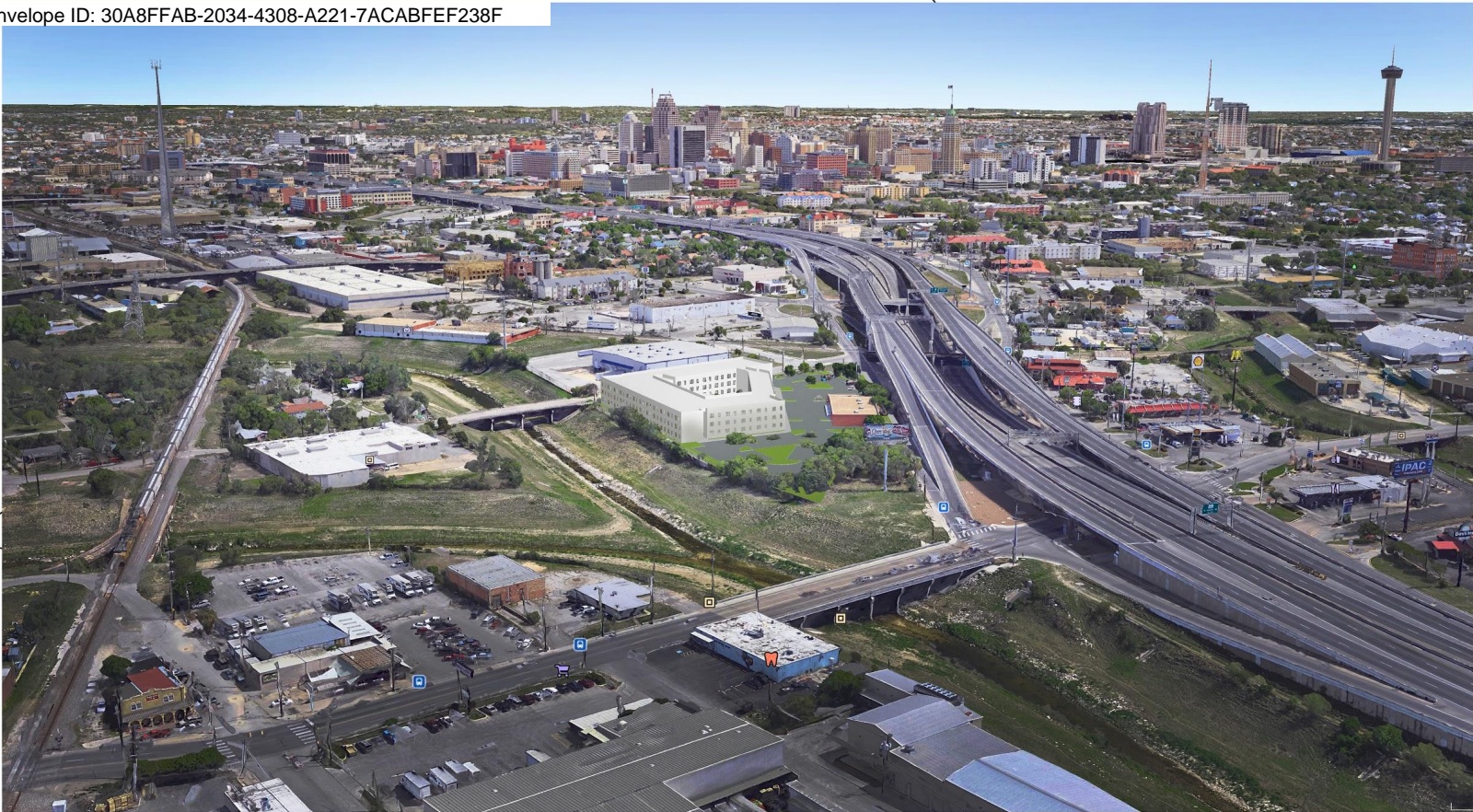
S. PECOS LA TRINIDAD