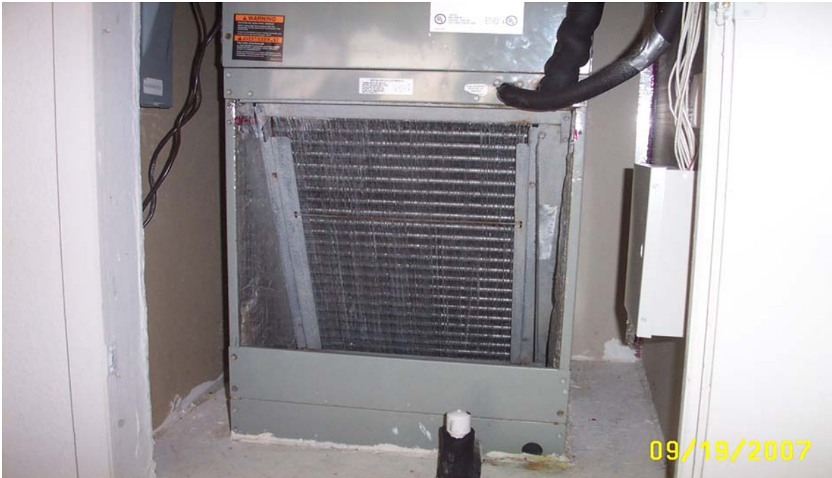
Photo 15: HVAC Closet- Return air plenum side of AC condensate coil.