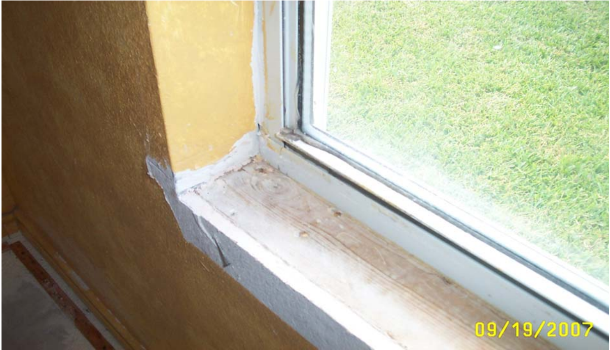
Photo 11: Master Bed Room- Removed window sill and apron along the side exterior wall window.