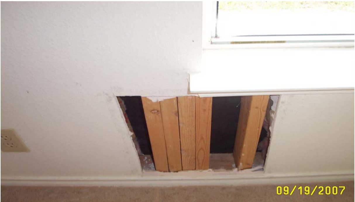
Photo 6: Front- Inspection hole below the left side of the exterior window.