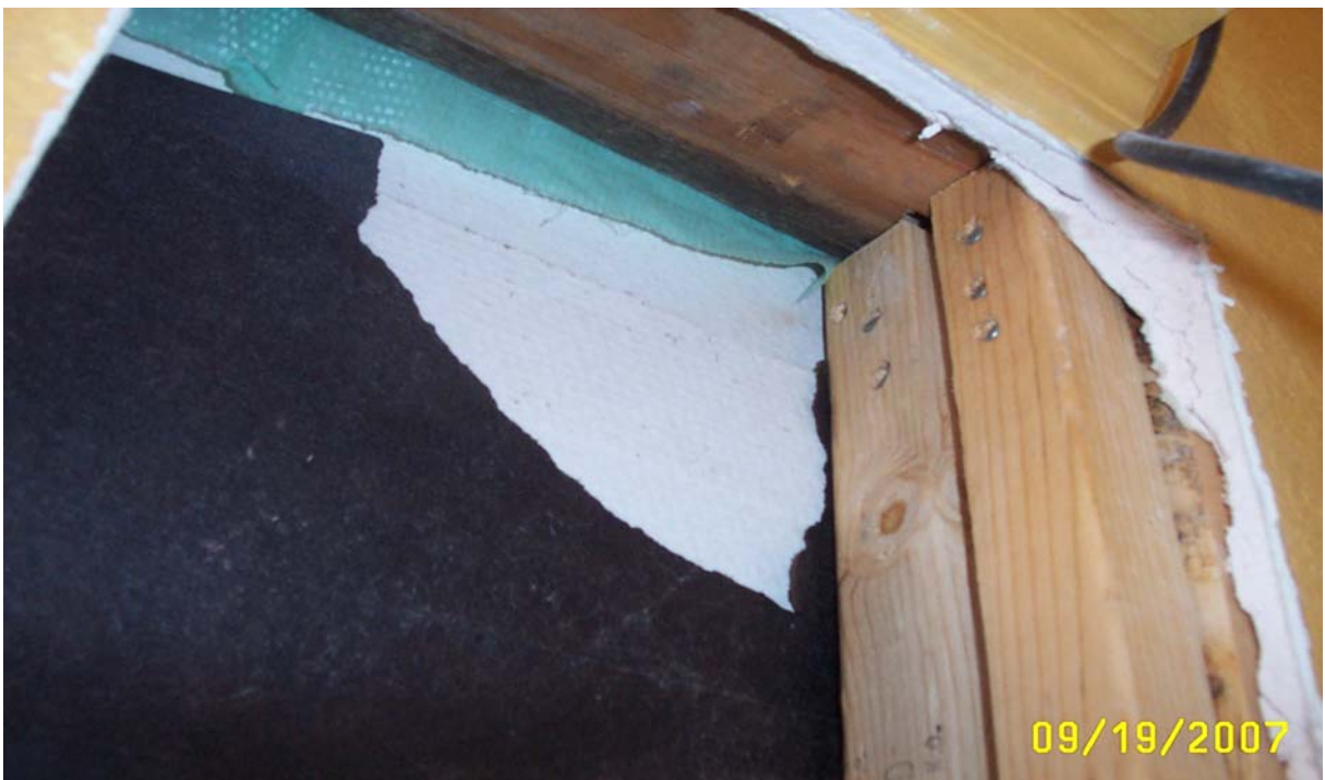
Photo 10: Master Bed Room- Inspection hole below the right side of the exterior wall window.