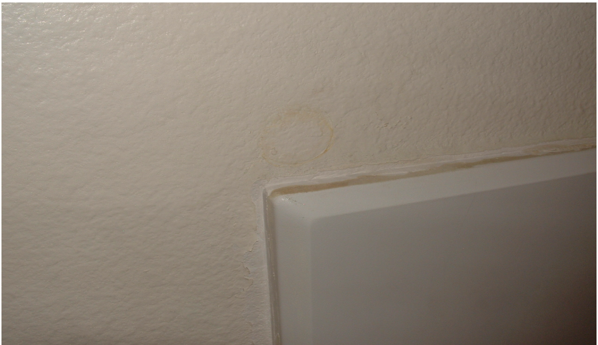
Photo 12: Master Bath Room- Remove caulk at the top lip of the fiberglass tub surround.