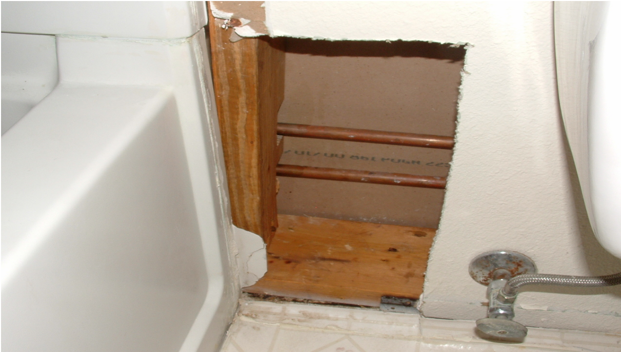
Photo 13: Master Bath Room- Wall cavity at the head end of the tub.