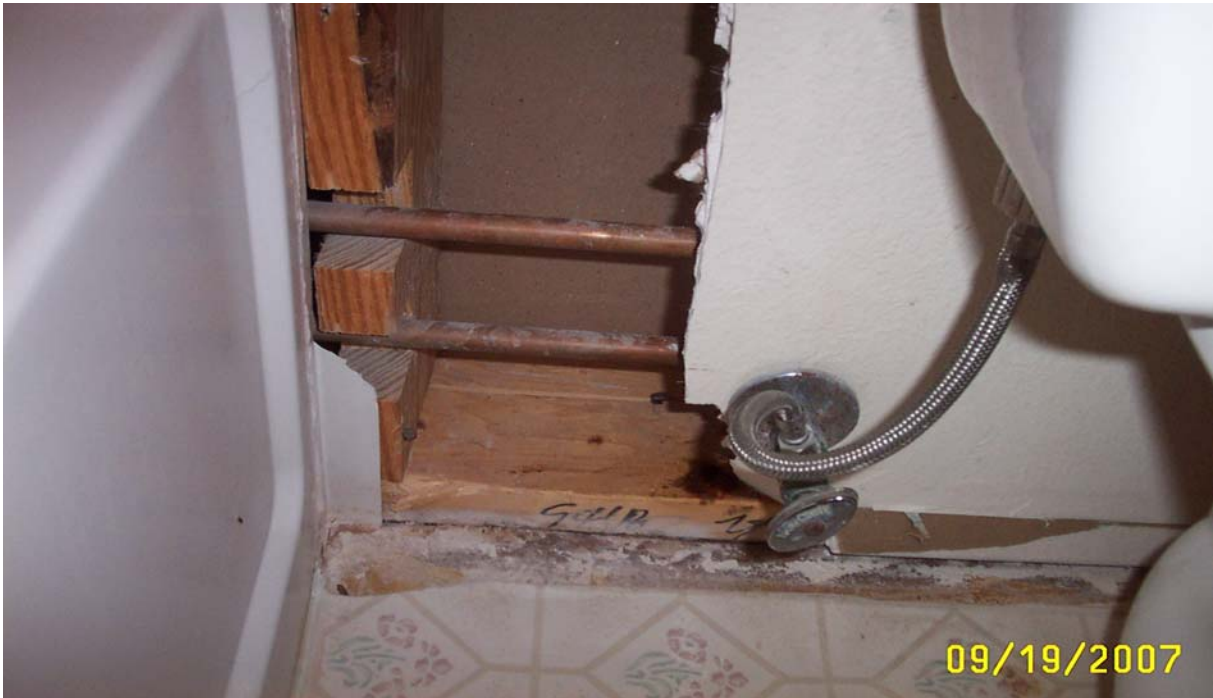
Photo 7: Hall Bath Room- Wall cavity behind toilet at head end of tub.