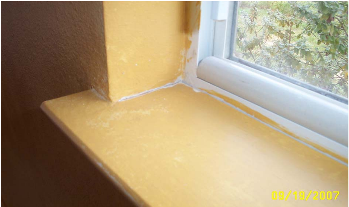
Photo 9: Master Bed Room- Removed caulk along exterior wall window.