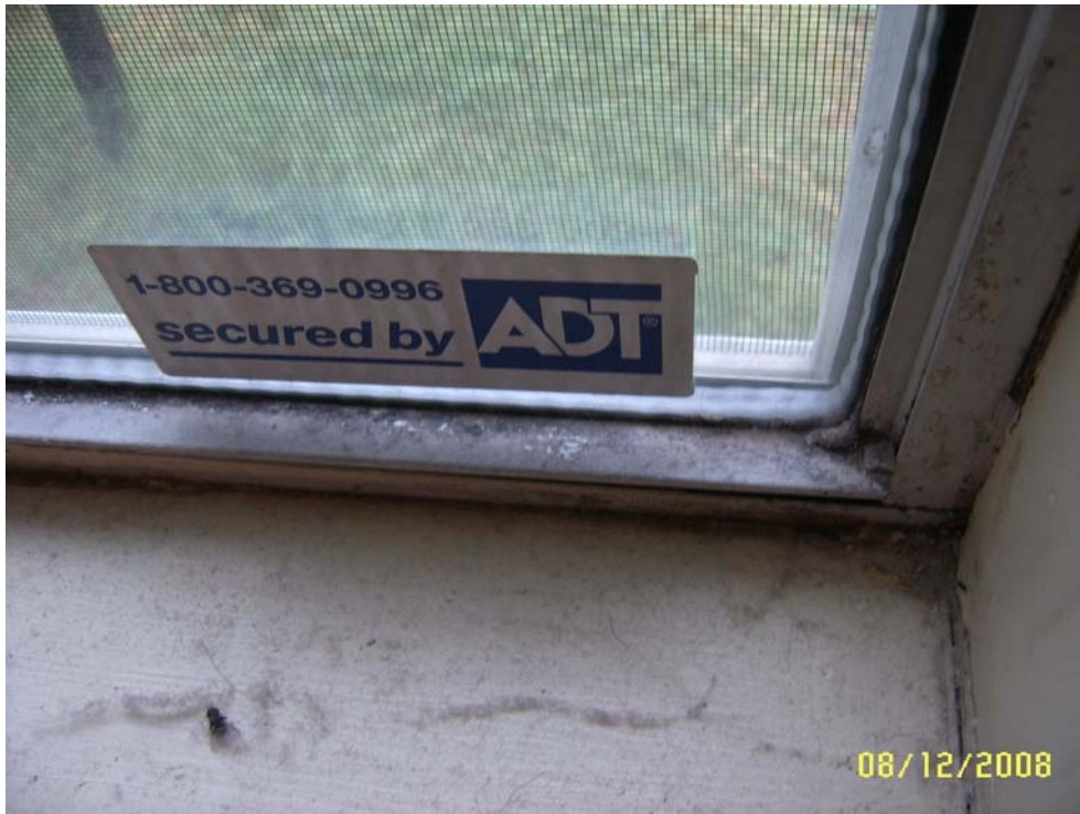
Master Bedroom window