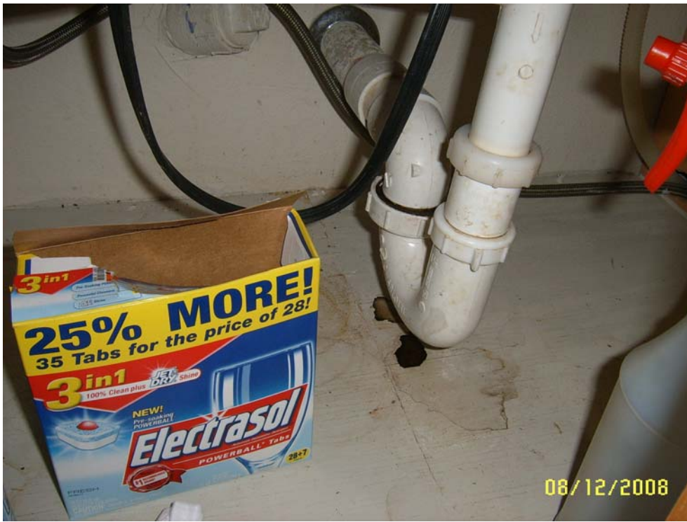
Kitchen - shelf below sink with water present on drain connection